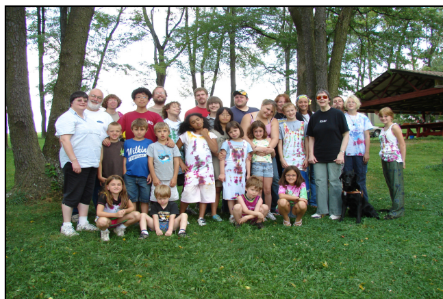
Campers from Explorer Day Camp and Fun Factor Camp take time out to pose for a group photo.

Agapé can still boast of a one year improvement in reading skills in just one week of summer camp. We attribute this to small classes, a secure en-